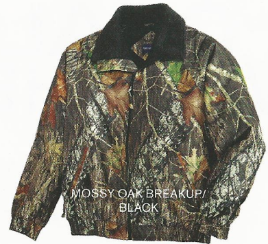
MOSSY OAK BREAKUP/ BLACK