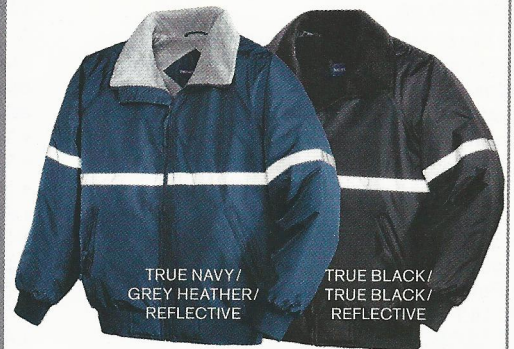
TRUE NAVY/ GREY HEATHER/ REFLECTIVE